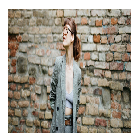
PURL PAL: The Simple Bralette