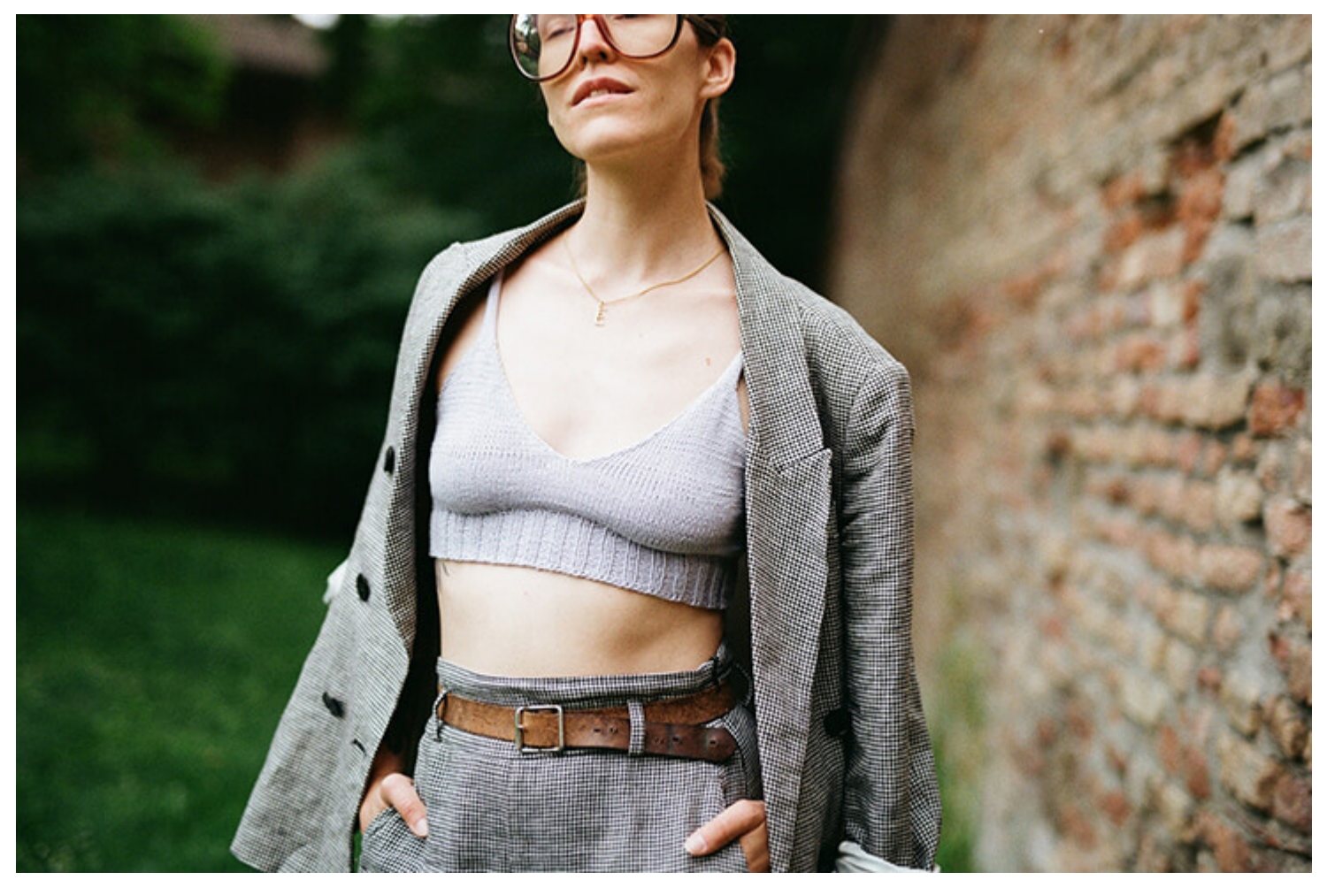
The Simple Bralette by Naked Knit in Cubria by Pascuali, shot analogue by

The mesh structure is super pretty and has a very fine and right amount of shine without looking super structured like those cheap extremely shiny cotton yarns. And did I mention how soft it is? It's the cashmere under the vegan friendly/plant based yarns. Yes – THAT soft. So for me, it was the perfect choice.