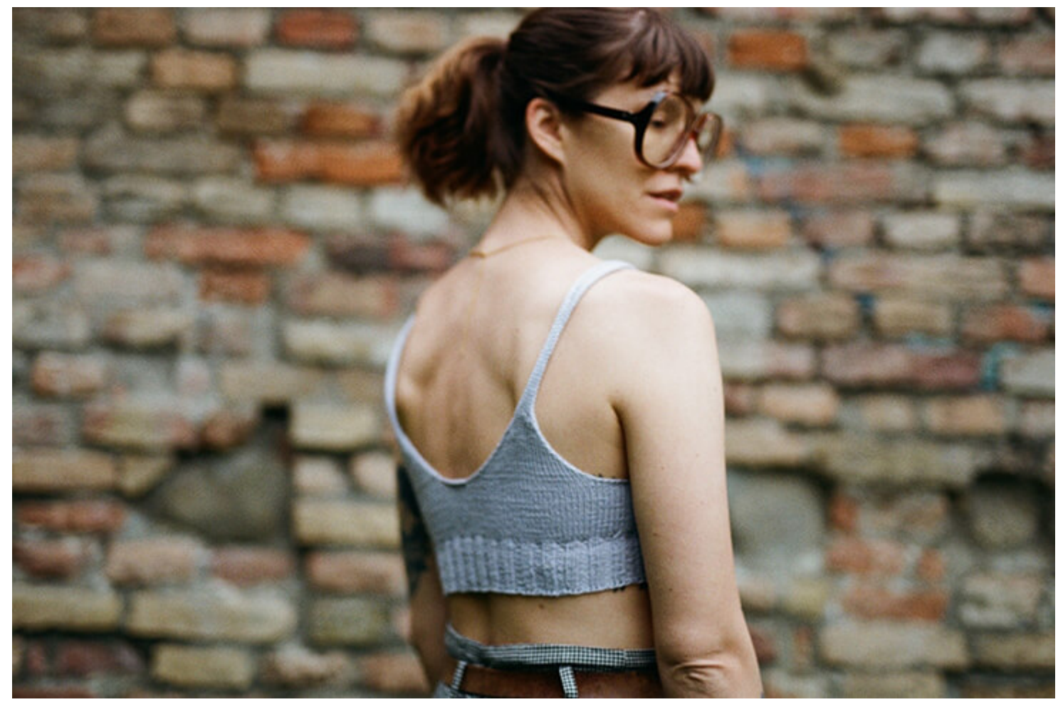
The Simple Bralette by Naked Knit in Cubria by Pascuali

To be honest – the summer knit struggle is real. Don't get me wrong – I love summer yarns and all the cute tops, but (and it's a big one) those thin needles are killing me. I'm always a bit afraid that summer will be over before I'm able to finish my summer knit. I'm just not made for those itsy bitsy thin needles, I prefer my knits the way I prefer my sewing projects – quick!